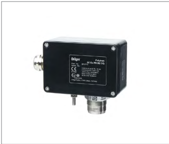
Dräger Polytron SE Ex M2