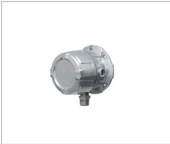
Dräger Remote Sensor DQ NPT