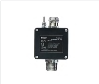
Dräger Polytron SE Ex M1